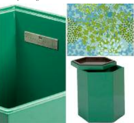
This Barclay Butera piece is more stationary than movable, but for small visible laundry areas, it's a great touch.

This antique Italian Tole lamp has gone to live with a client in Florida, but is was incredible. I share this so you are free to go bold.